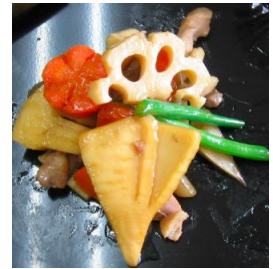
<boiled dish 'Fukiyose-ni' >