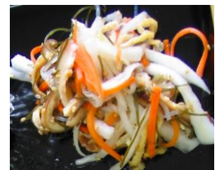
<Vinegared seven-good -luck vegetables >

【Applications · Inquiries】 Fukui International Association FIA Reinan Center Kagura-cho 1-4-26, Tsuruga City TEL: 0770-21-3455 FAX: 0770-21-3441 E-mail : reinan@f-i-a.or.jp HP: https://www.f-i-a.or.jp/ja/reinan/